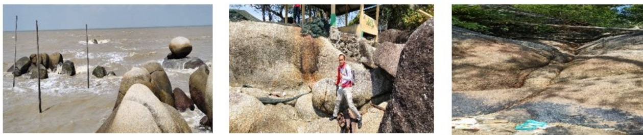
Figure 2. Batu Limau Village Beach