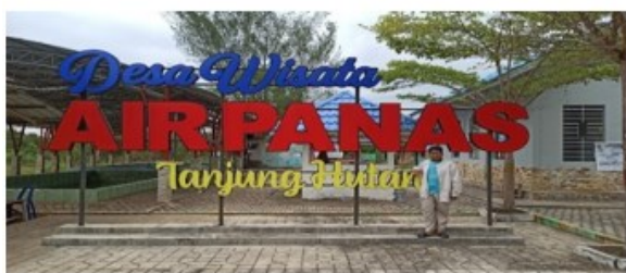
Figure 1. Tanjung Hutan Hot Springs

Hot springs are generally found in mountainous or highland areas. Located in the lowlands on a small island in Tanjung Hutan Village, Buru District, Karimun Regency, Riau Islands Province, this bathing place offers significant uniqueness. Unlike the natural hot springs in many other areas, the hot water in Tanjung Hutan does not contain sulfur. This tourist destination has great potential to become a major attraction for tourists, both domestic and foreign, given its unique value. With its strategic location, it also has the potential to become a top choice for individuals seeking a means of relaxation or stress relief from the hectic routine of urban life. In addition, the stunning natural scenery in Tanjung Hutan Village provides an aesthetic added value that is very attractive to visitors.