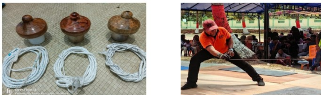
Figure 4. Inflated Gasing

Frequency analysis of themes in the development of sports tourism in the district based on natural and cultural resources: