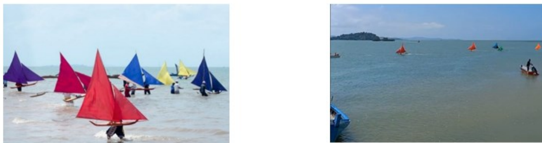
Figure 3. Jong boat

The first part is the body or body of the boat which serves as a place to attach the sail and later axle. Furthermore, the soak Jong serves to break the waves of the water through which the boat passes. The chapter house, located in the boat section, serves as the fulcrum of the kater axle, ensuring that the Jong boat remains stable and does not easily sink when sailing. The fourth part is the Jong cap, which serves to protect the boat from incoming water. The jeep boom is the fifth component used to tie the jeep from the tip to the top two-thirds of the sail. The Jong sail, which is the sixth part, serves to catch the wind and propel the boat forward quickly. The jeep, as the seventh part, serves to contain the wind at the front of the boat and steer the Jong boat. Finally, the eighth part, the axle and the water located in the center of the boat serves to keep the boat balanced. In terms of size, a small Jong is about 130 centimeters long, while a medium-sized Jong is about 160 centimeters long, and a large Jong is about 190 centimeters long.